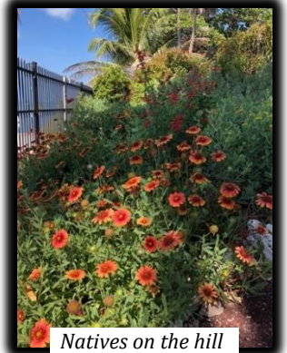
Natives on the hill