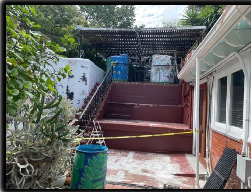
The rampart below the water tanks have been redone with the efforts of DeAnn Schofield and Nell Smets