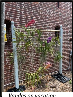
Vandas on vacation.