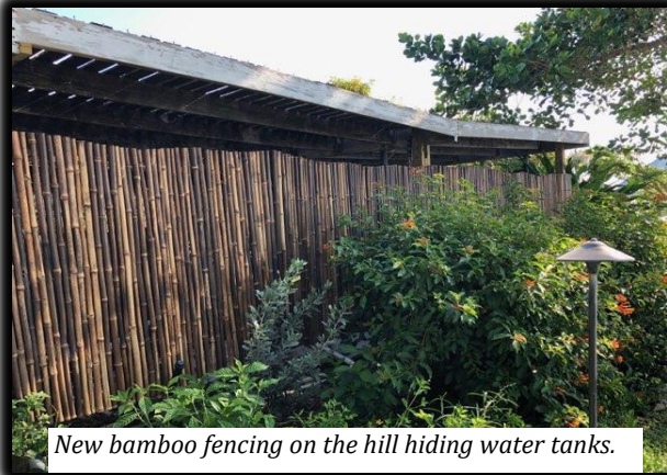
New bamboo fencing on the hill hiding water tanks.