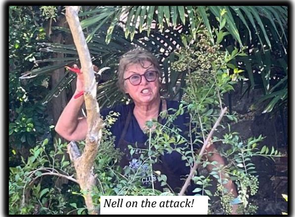
Nell on the attack!