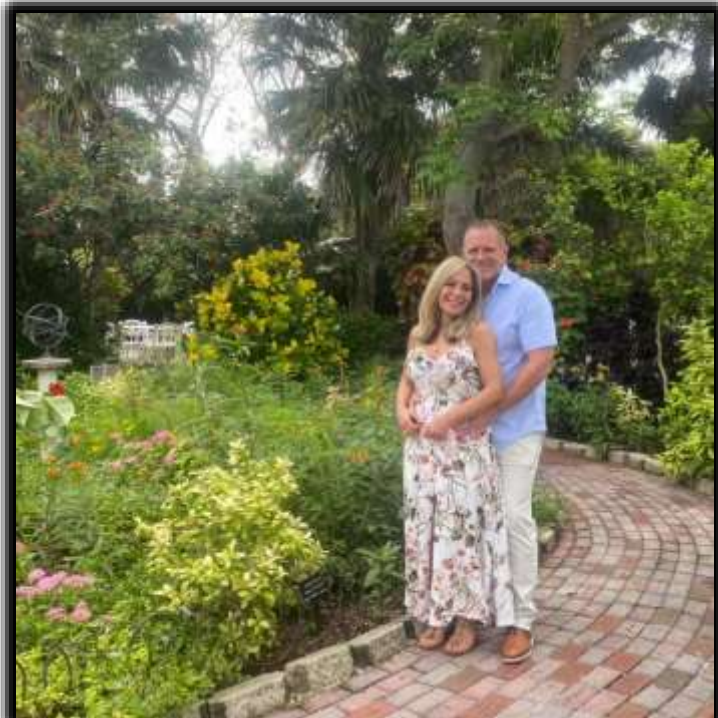
Aren't we a gorgeous setting for a wedding!?!