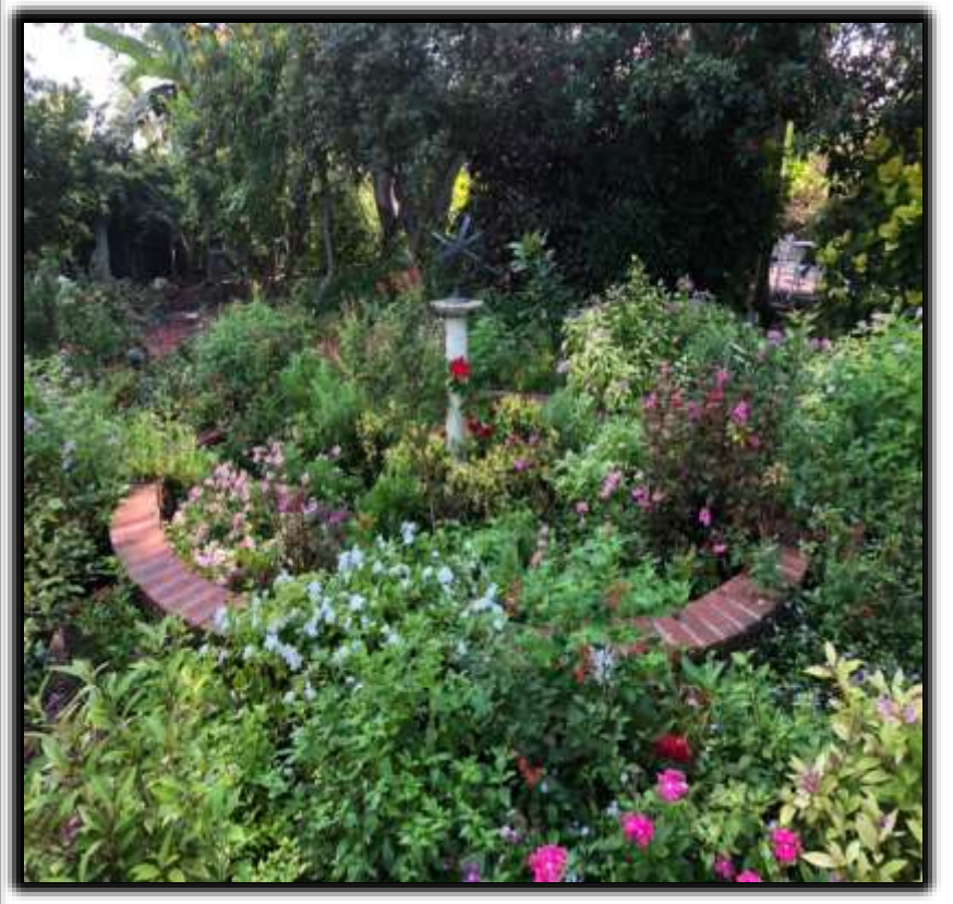
The Butterfly Garden in all its glory