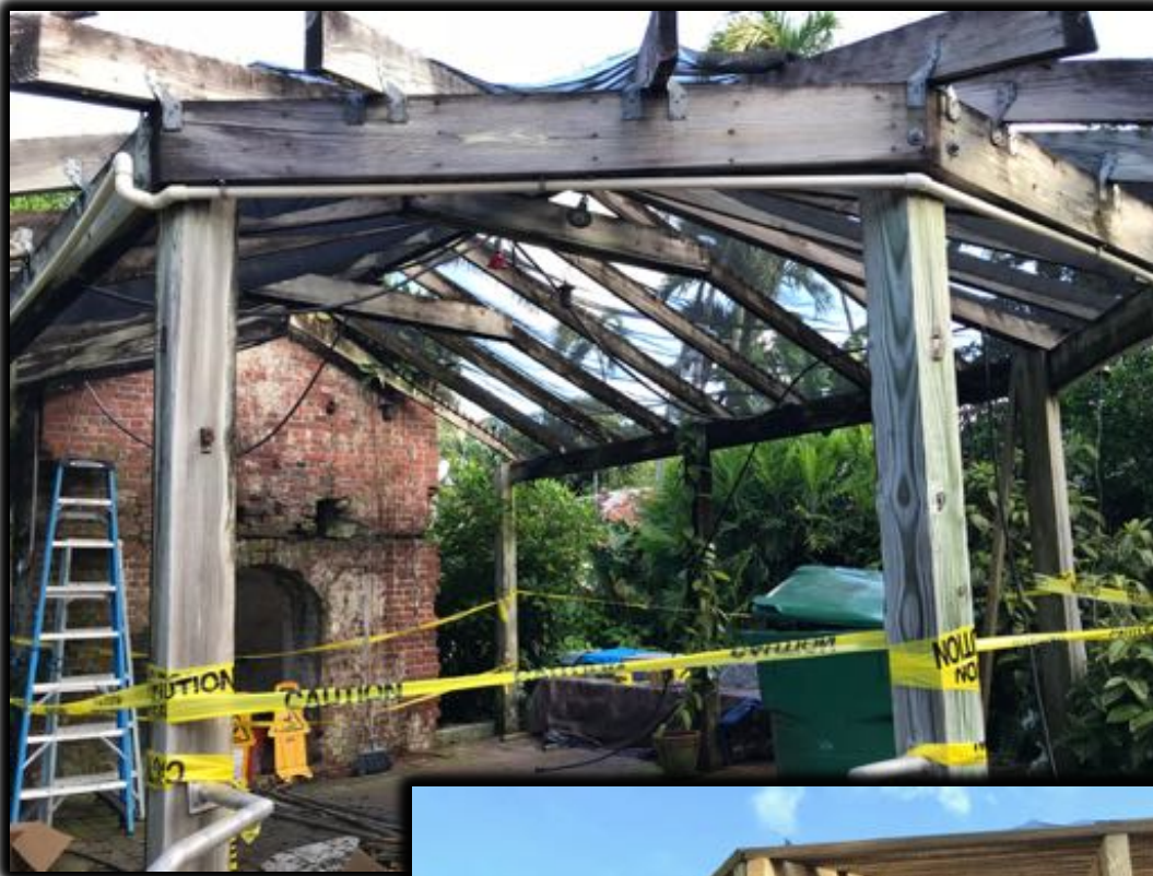
Almost done and waiting for a new shade cloth.