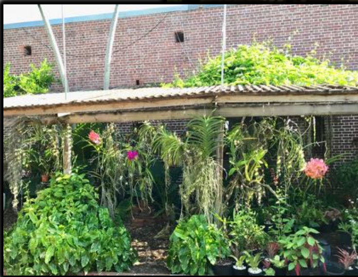
We have expanded our space for orchids. There are now more in the arbor by the office door.