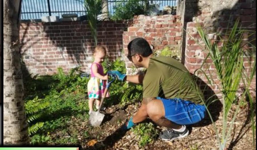
Floral Design Summer

This little one was visiting with her Dad who is in the Navy. A future gardener!!